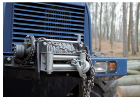
Hydraulic winch can be fitted as optional equipment