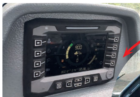
Comfortable, ergonomic, 180° revolving cabin provides perfect views