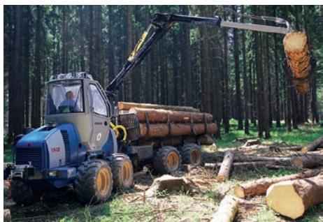
Perfect maneuverability in thinnings