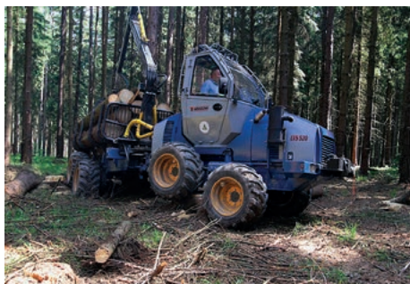
Perfect maneuverability in difficult terrain