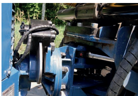
Frame lock on the forwarder provides good stability