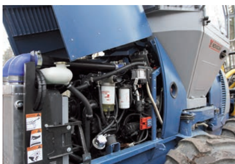
Easy access to the engine = easy maintenance