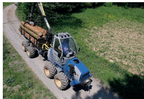
Forwarder for professional work